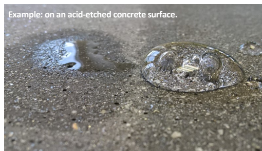
Left: unprotected water penetrates the surface easily